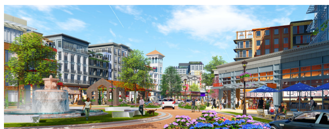
A rendering of Bridgeway Station