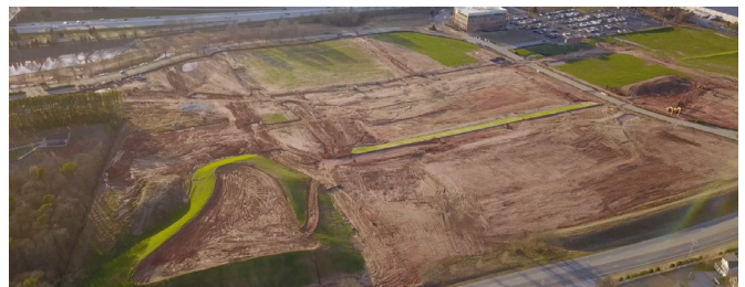
An aerial view of the new Logos Theatre land