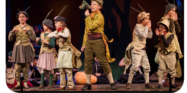
The Ant and the Grasshopper